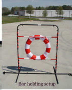
Bar holding setup

This tire jump set can use two bars to hold tire on the frame. If dog hits it, tire falls. For this setup just turn the bar holding pieces on each side toward center. Connect bars together and put them through the grommets on tire. Then put bars on the frame where the height is desired.