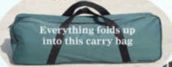
Everything folds up into this carry bag