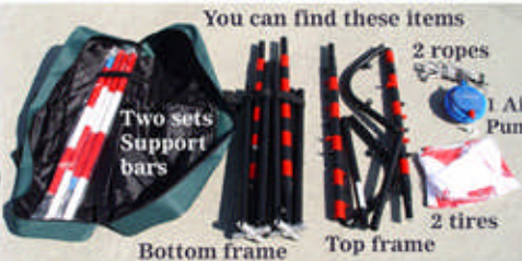
Two sets Support bars