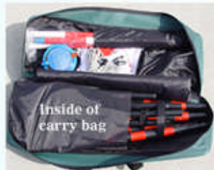
Inside of carry bag